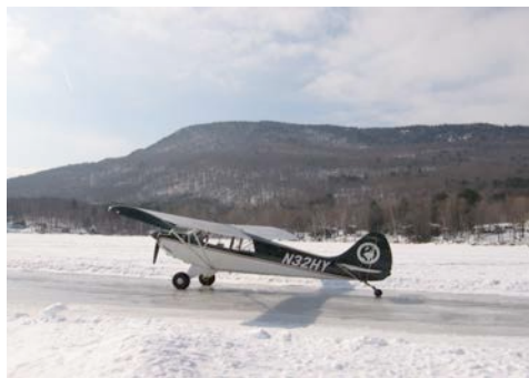
Impromptu flight to remote lake smoke house for sausage

Always use backcountry flying ethics when flying into private and public lands.