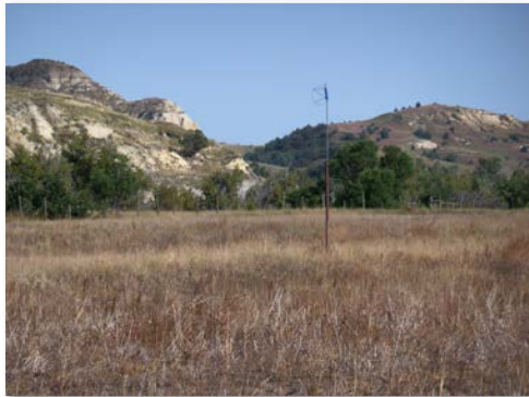
Ebert's Ranch airstrip in North Dakota