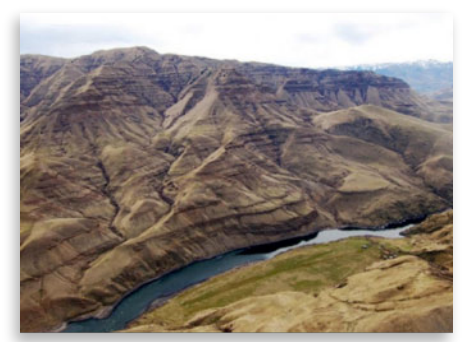
Doug Bar airstrip in Hells Canyon.

I was invited to join the Hells Canyon Recreation Collaborative (HCRC) whose mission is to: "Work collaboratively to maintain and improve recreation access into the Hells Canyon National Recreation Area by boat, raft, foot, vehicle, horseback, aircraft and associated historical infrastructure by making recommendations to the US Forest Service; promoting a sustainable recreation experience through the involvement of a broad group".